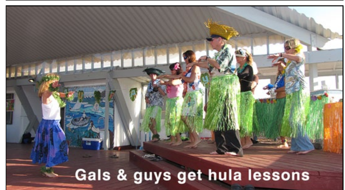
Gals & guys get hula lessons