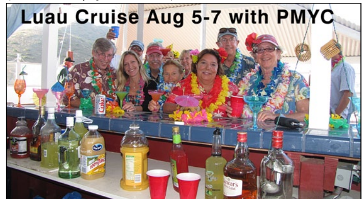
Luau Cruise Aug 5-7 with PMYC